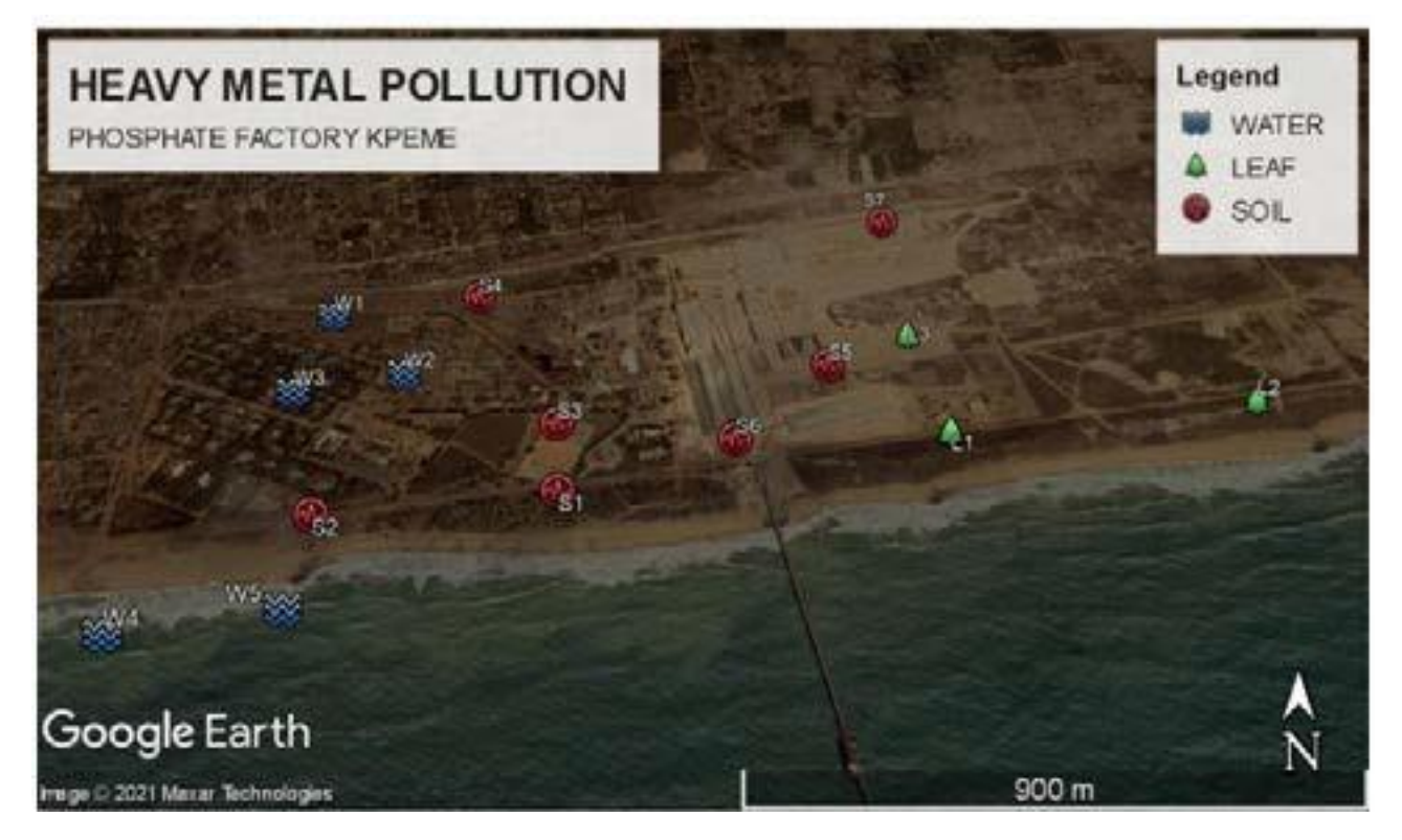
Figure 1. Google Earth map of the Hahotoé phosphate mining area showing the different samples collected