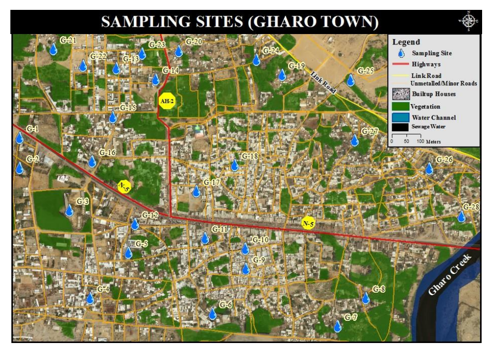
Figure 1. Map of sampling sites of Gharo city.