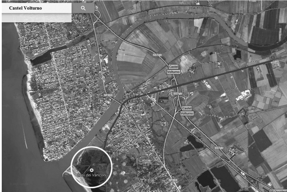
Figure 2. Sampling transect from the mouth of the river to the inner part of Castel Volturno municipality

Covariance station at the Capodimonte site is under construction. To date, an important range of analysers has been collected, in detail: Irga analyser for CO 2 and H 2 O Li – 7200 (LI-COR), CH 4 Li – 770 (LI-COR) analyser, O 3 Fast ozone analyser (Sextanttechnologyltd), Li – 7550 (LI-COR) interface, CNR4 radiometer (Campbell scientific), CR1000 acquisition system (Campbell scientific).