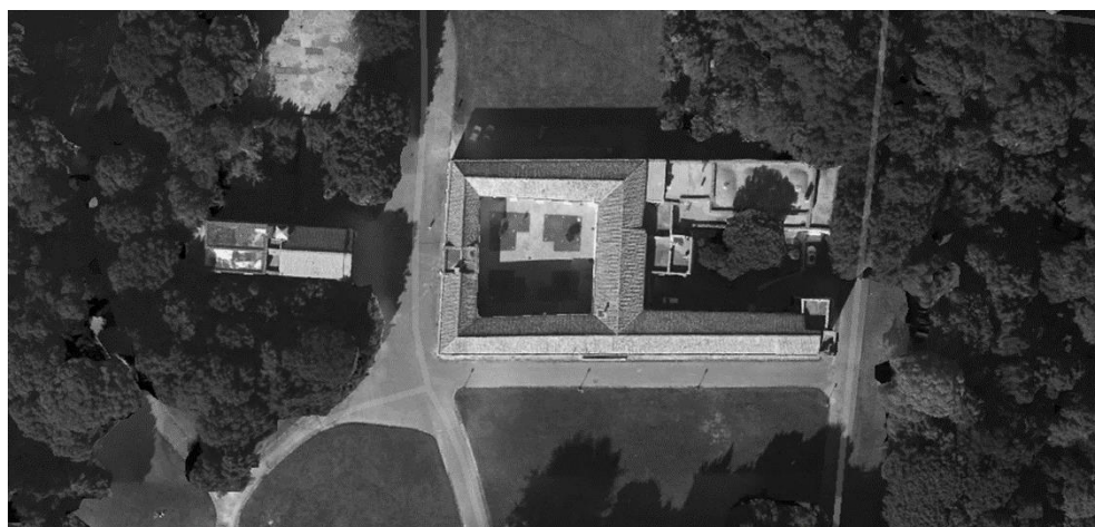
Figure 1. Capodimonte’s site

The interested study areas are the Naples’ Bosco di Capodimonte (Figure 1) and the Oasi Variconi near Caserta (Figure 2). For what regards the Bosco di Capodimonte, the micrometeorology station will allow the complete monitoring of the concentrations of the main greenhouse gasses and will allow to define the role of vegetation on the deletion or creation of secondary polluting agents such as ozone and particulates. Near the mouth of the Volturno river, through the analysis of the stable isotopes of C and O, we have been investigating to check if the saline wedge phenomena (Sea Water Intrusion) was taking place in the aquifer.