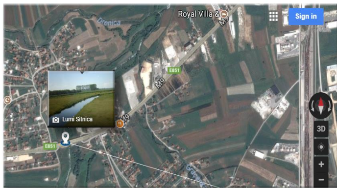
Figure 2 Sampling location - Sitnica River

At least 32 other different polluters are identified in the vicinity of Sitnica River, which contributes directly to its pollution (The State of Water in Kosovo - Report, 2010). Sitnica River is also endangered by various industrial activities such as ironmongery, the food and textile industry, the metallurgical and chemical industry as well as the energy industry. Therefore, the Sitnica River will be used for this research. The sampling location, as shown in the Figure 2, is Sitnica River near the Vragoli, with the coordinates 42.609138 latitude and 21.061295 longitude. The water samples from this location will be used for the development of a site specific regression model between turbidity and Total Suspended Solids.