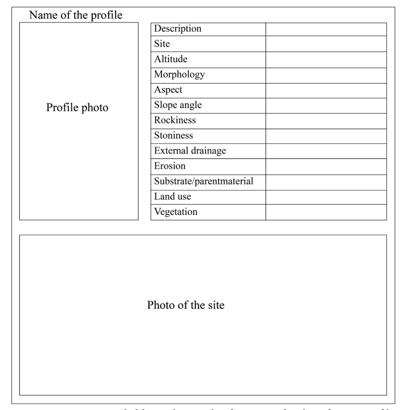
Figure 1. Recommended basic data and information for the reference profile

Therefore, if the soil in the plot of interest is close, for example, to the Type A reference profile (Scorusa Series; Figure 2), whose description and analytical data are available, the technician should simply write the taxonomic family in bold (for the description of the taxonomic family see Raimondi et al., 2000). The profile sheets will have a shape similar to that shown in Table 4. The recommended data to be recorded for a reference profile are given in Figure 2.