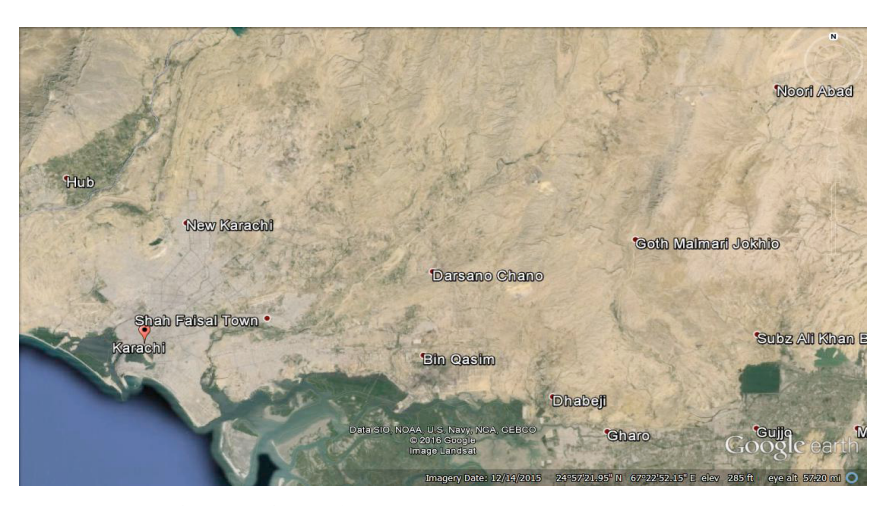
Figure 1. Map showing the study area

At these locations, besides open waste dumping, the heavy influxes of traffic, waste from commercial shops, and other roadside activities were observed. To collect data, a two-month survey during Sept.– Oct. 2017 was carried out. All soil samples were randomly collected at a depth of 0-3 cm using a hand auger. In order to compare the impact of MSW dumping, the control soil samples not treated with MSW were also obtained. The investigation of each site was carried out repeatedly. A total of twelve soil samples, two from each